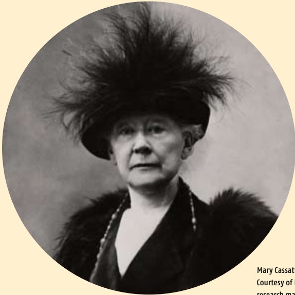
Mary Cassatt, 1914 (detail).